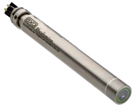
Figure 1: EXO Rhodamine Sensor

An EXO Conductivity/Temperature sensor must be installed. The effect of temperature on the Rhodamine sensor electronics and the fluorescence of Rhodamine WT can be significant; however, the combination of these two factors is automatically taken into account by the sensor firmware providing temperature compensated readings. This means the "Standard Values" entered during the calibration procedure should match the concentration of the solutions prepared regardless of temperature variance.