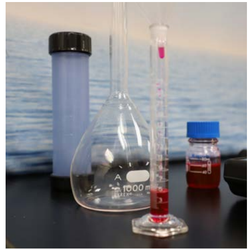
Figure 2: Rhodamine WT dye and measurement equipment.

NOTE: Preparation of the following solutions requires precise measurement equipment including graduated pipets and volumetric flasks.